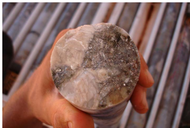
Two photographs of diamond core from Hole ARMCRCD001 showing sulphide mineralisation hosting gold, silver and copper. This hole was drilled 200m west of the main mineralisation at Mt Clement and represents a significant step-out discovery of a new zone of mineralisation.